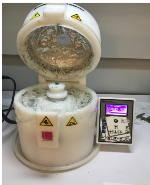
Fig. 2. Spin coater model WS-650MZ-23NPPB