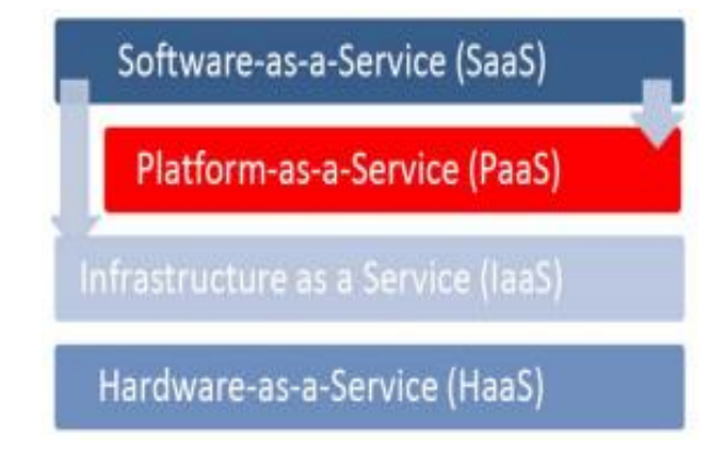
Fig 1. Cloud services [12].